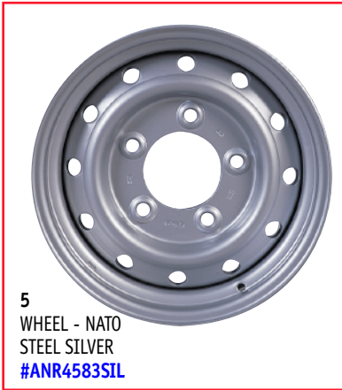
5 WHEEL - NATO STEEL SILVER #ANR4583SIL