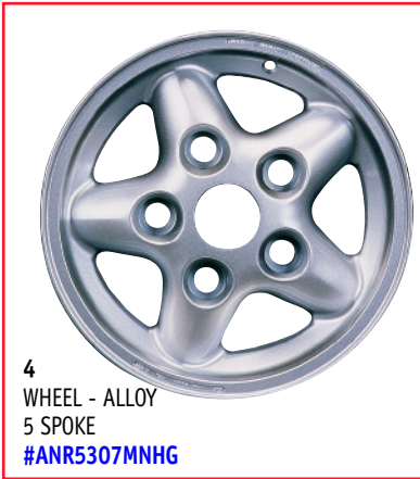
4 WHEEL - ALLOY 5 SPOKE #ANR5307MNHG