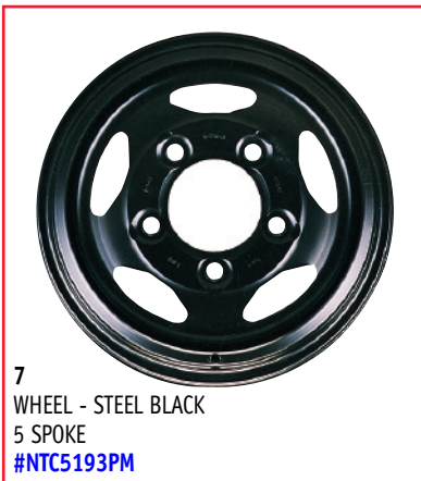
7 WHEEL - STEEL BLACK 5 SPOKE #NTC5193PM