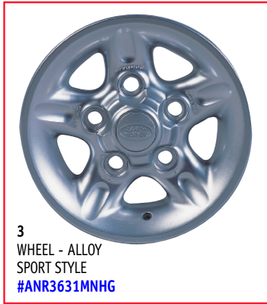
3 WHEEL - ALLOY SPORT STYLE #ANR3631MNHG