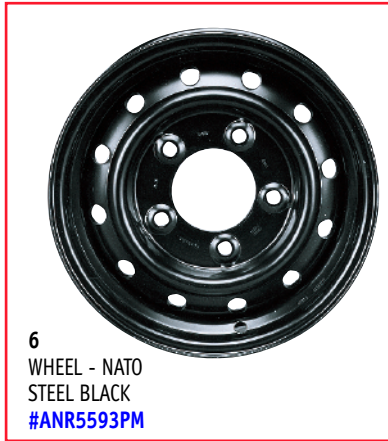
6 WHEEL - NATO STEEL BLACK #ANR5593PM