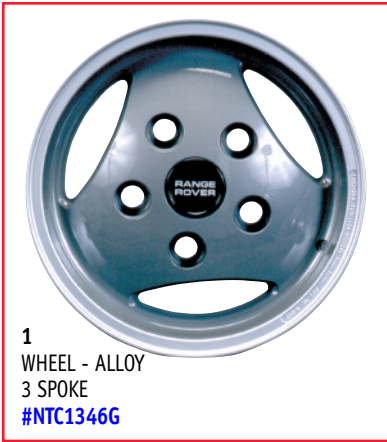
1 WHEEL - ALLOY 3 SPOKE #NTC1346G