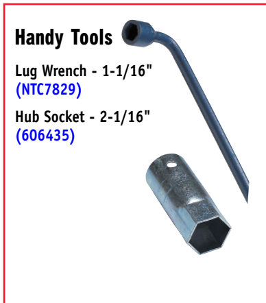
Handy Tools Lug Wrench - 1-1/16" (NTC7829) Hub Socket - 2-1/16" (606435)