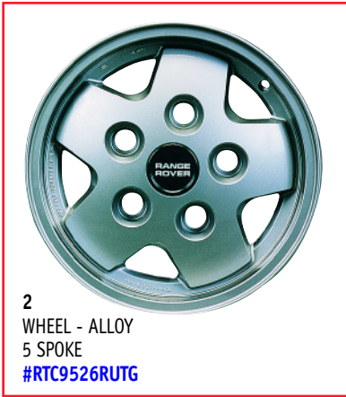
2 WHEEL - ALLOY 5 SPOKE #RTC9526RUTG